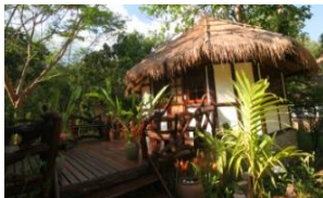
River Kwai Resotel