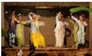
Mon Dance Presentation