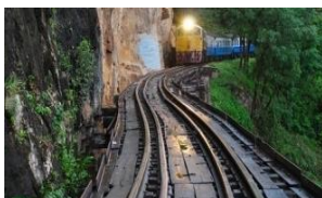
Death Railway Train