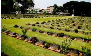
Allied War Cemetery