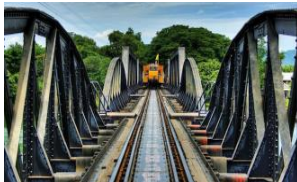
Bridge over the River Kwai