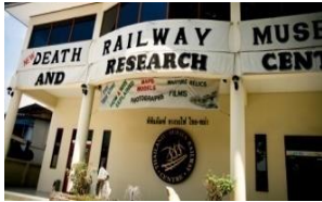
Thailand–Burma Railway Centre

Highlight: Thailand–Burma Railway Centre, War Cemetery, River Kwai Bridge, Mon Tribal Village, Mon Dance, Hellfire Pass Memorial, Death Railway Train and Stay at River Kwai Resotel